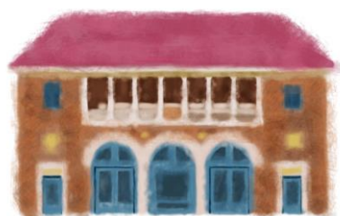
A Friend to the Redwood City Public Library

From the article: "Despite the proliferation of digital-based activities over the past two decades – including digital books, podcasts, streaming entertainment services and advanced gaming – libraries have endured as a place Americans visit nearly monthly on average. Whether because they offer services like free Wi-Fi, movie rentals, or activities for children, libraries are most utilized by young adults, women and residents of low-income households."